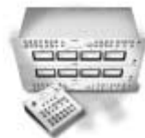
MultiMAX EX, ForMAX and VuMAX are tightly integrated.