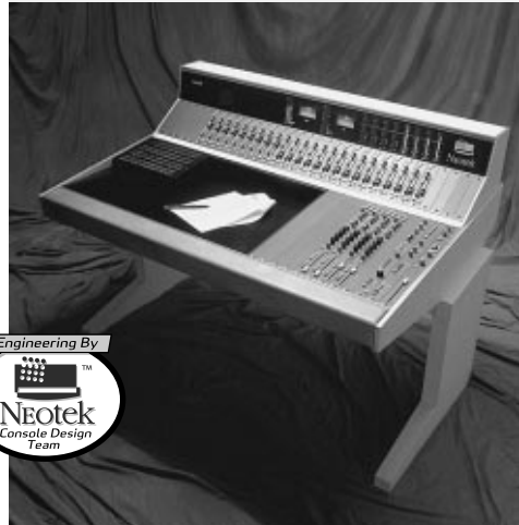
Essence Neotek Console

Also see these Audio Horizons Fall '98 articles: Elite II: "The Value of A Console" page 8 "Escape the Semi-Pro Pigeonhole" page 9 MultiMAX: "Do Surround Projects" page 1 RMS: "Control Your World" page 3