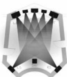
A 7.1 speaker setup

is normally available for the Lc and Rc channels in 7.1 formats. The setup menus allow selection of either Surround EX or 7.1 mode, but not both modes simultaneously