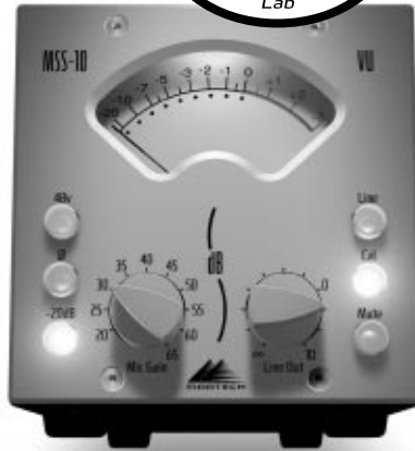
MSS-10 Mic Preamp